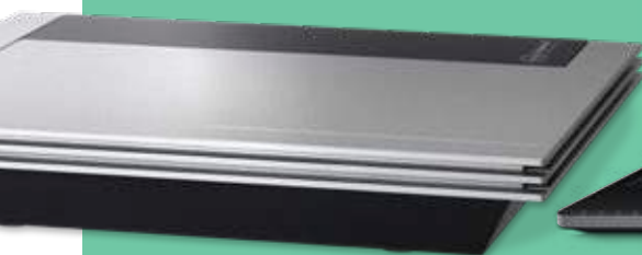
The Equinox 2.0

Hearing aid diagnostics in a compact modular solution.