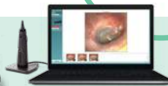
Viot™ Video otoscope