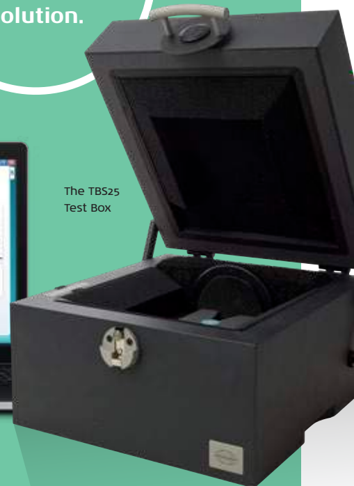
The TBS25 Test Box