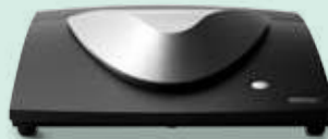
Affinity 2.0 The integrated fitting solution