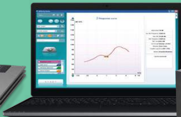
The Interacoustics Hearing Instrument Testing software