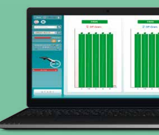
DPOAE440 DP-Gram with a PASS in bar view