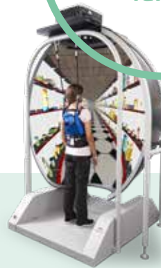
Bertec® CDP/IVR Computerized Dynamic Posturography