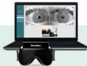
VisualEyes 505 Video Frenzel