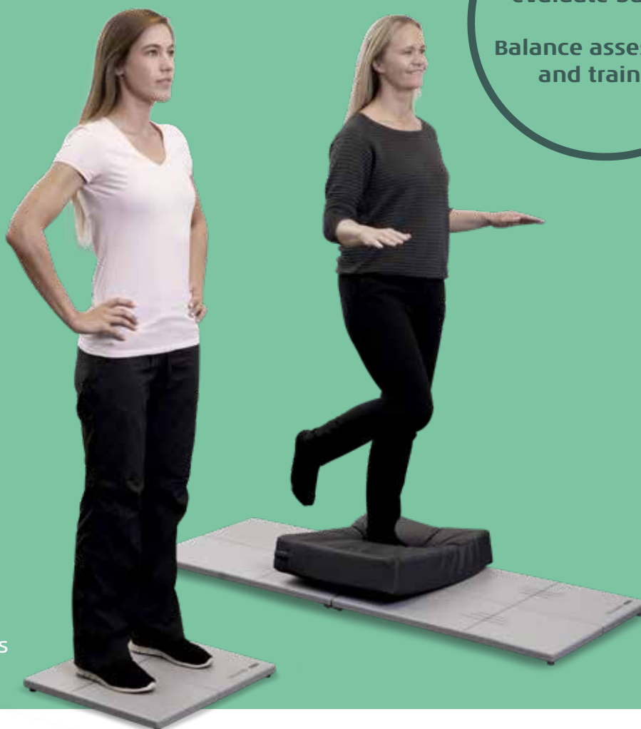
Balance Quest by Interacoustics