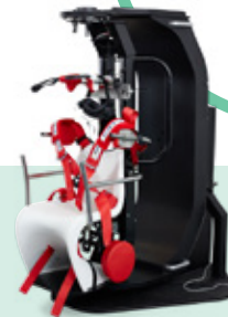
TRV Chair Diagnosing and treating Benign Paroxysmal Positional Vertigo (BPPV)