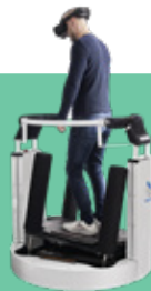
Dynamic force plate