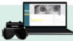
VisualEyes™ 525 Complete VNG solution for balance assessment