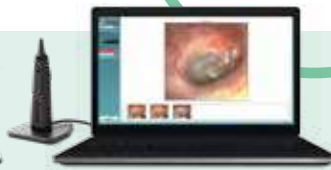
Viot™ Video otoscope