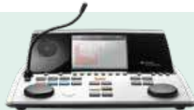
AD629 Diagnostic audiometer